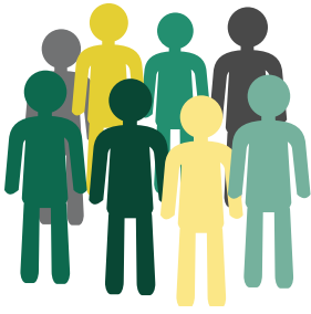
Your people power