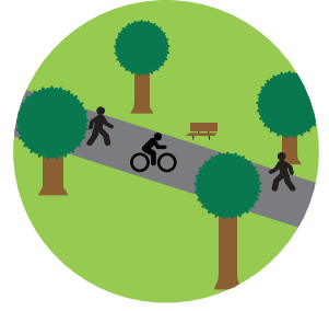
Thriving public spaces

Looking for a simple way to make a big difference? Volunteer groups and individuals are invited to plan a cleanup event in a city park or public space. City staff will work with volunteers to identify a cleanup location and trash drop site(s). Safety vests and garbage bags will be provided.