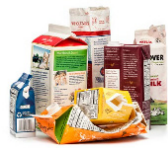
Dairy & Juice Cartons